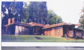
Florence, Alabama - Frank Lloyd Wright Rosenbaum House